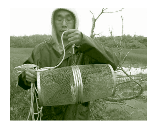
Yupik youth testing for endocrine disrupting chemicals in local streams.

cine are forced to balance a traditional plant-based healing practice with the fact that those plants are now contaminated by the toxins in the ground and water where they grow. While overlooked until now by a more urban-based, American reproductive justice lens, these issues have deep, long-lasting impacts on the health of women, children, communities, and their cultures. From the point of view of many Native activist and community organizations, the solutions must likewise address the deep, long-enduring impacts of not just the pollution but the impacts of the causes themselves – environmental resource extraction, colonization, and stolen land.