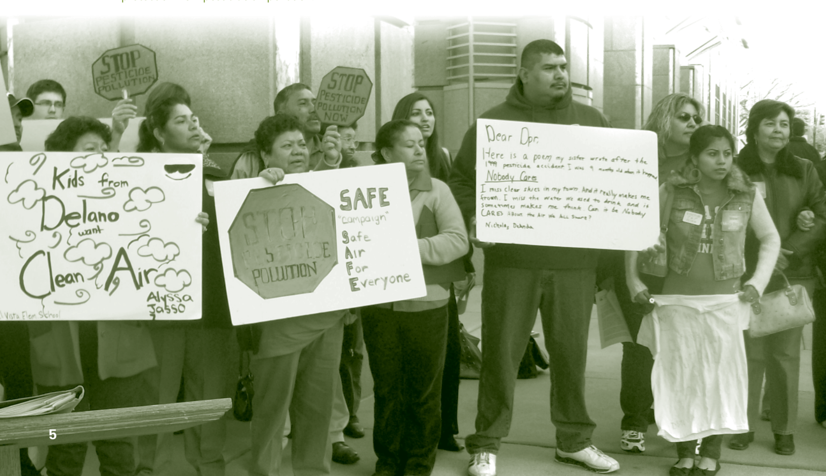
Communities from all over California rally in Sacramento demanding protection from pesticide air pollution.