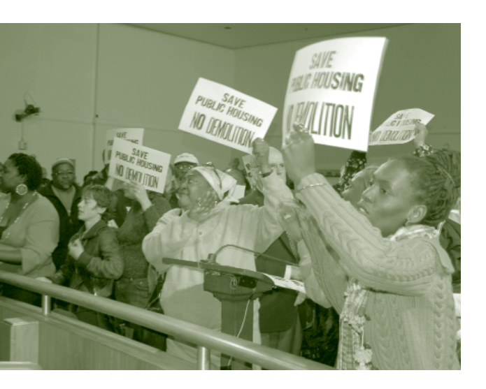
Public housing action by Coalition to Stop Demolition.